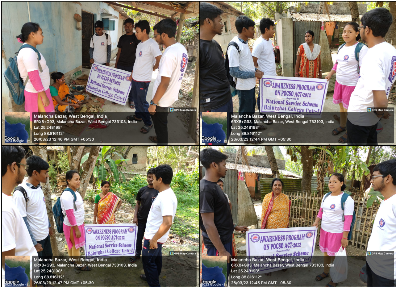
Volunteers talking to a mother of a girl child of the village and motivate her to educate her girl-child and aware her about the importance of child education in society.